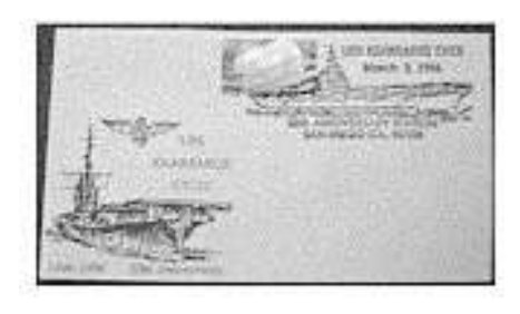
50th Anniversary 1st Day Cover Envelope $1.50