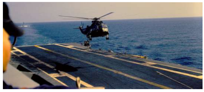
A Little Flight Deck Action To Enjoy